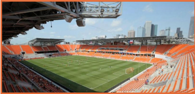
Shell Energy Stadium (22,039 - Temporary)