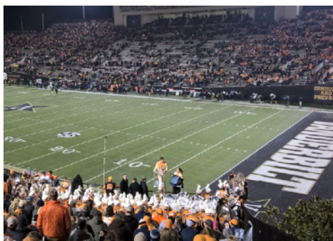
Vanderbilt Stadium (40,500)