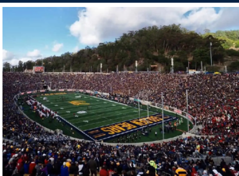
Memorial Stadium (63,000)