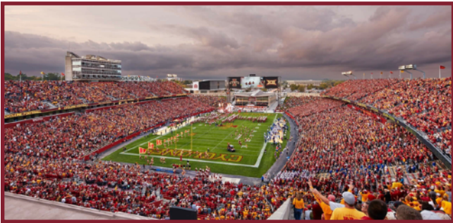
Jack Trice Stadium (61,500)