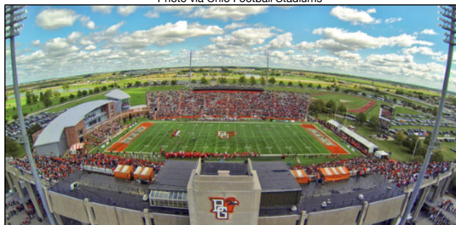
Perry Stadium (24,000)