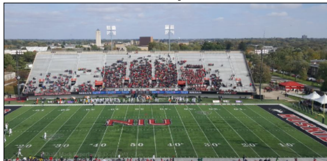
Huskie Stadium (23,595)