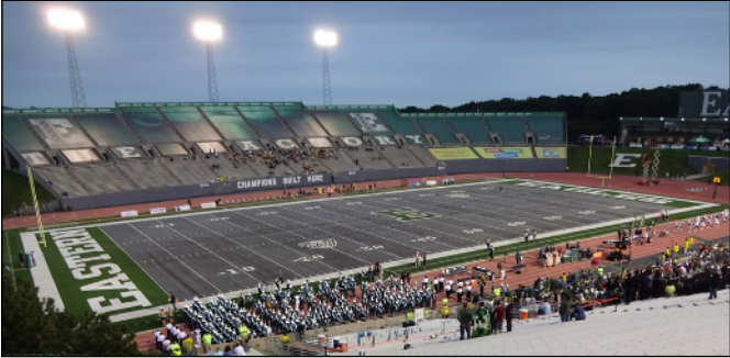
Rynearson Stadium (30,000)