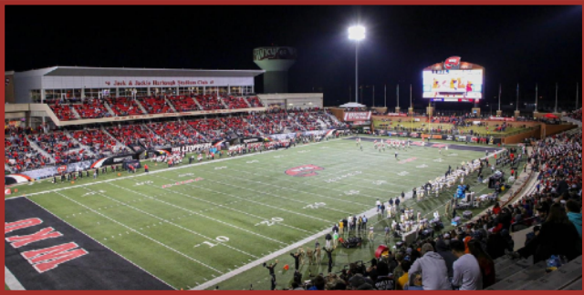
Houchens Industries-L.T. Smith Stadium (22,000)