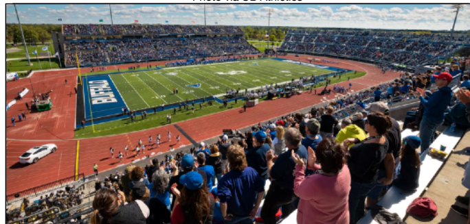
UB Stadium (30,270)