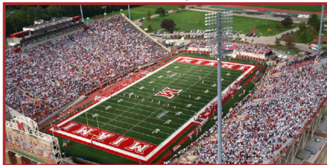
Yager Stadium (30,087)