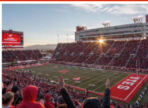
Rice-Eccles Stadium (45,807)