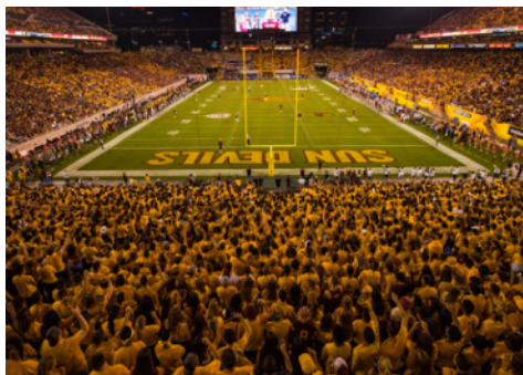
Sun Devil Stadium (53,599)