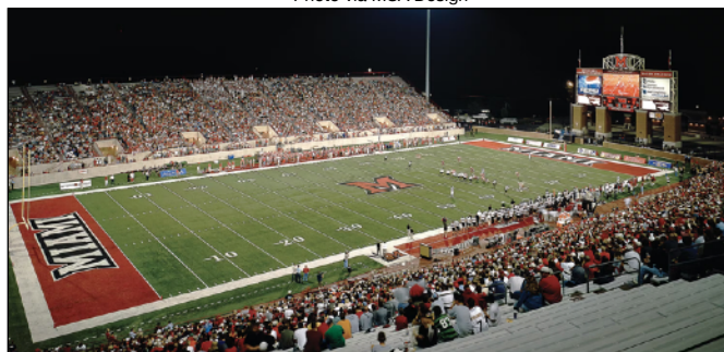
Yager Stadium (24,286)